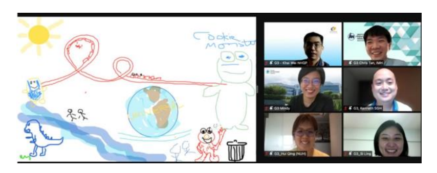
Energisers keep our participants engaged through the virtual seminars in 18th ILP.

The College also organised a post-programme day comprising of a leadership dialogue and a serious game session, for the participants of the 16th ILP to enable them to meet in person when the COVID-19 situation was more stable. This took place about 4 months after the main 16th ILP programme had ended. The participants were appreciative that the College made efforts to gradually reintroduce in-person sessions, whenever possible.