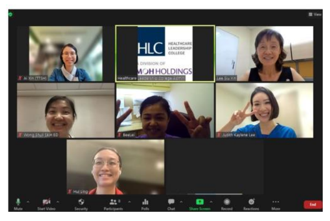
Online check-in with Programme Mentor for 3rd SNLP.