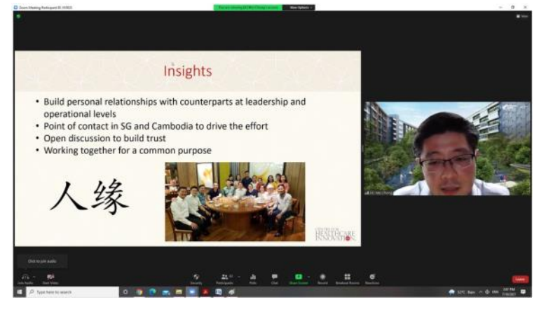
Participant-led sharings during 9th SLP.