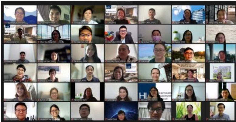
Going virtual for 17th ILP's cohort.

HLC continues to value add to the talent management and development effort for the public healthcare family across the clusters, institutions and professional groups. Since 2018, HLC has prepared an annual talent report for each of the three Cluster Board Chairmen, GCEOs, and GCHROs. The reports provide insights on talent management from a sectoral and cluster level to support the clusters in the development of their high-potential talent and successors.